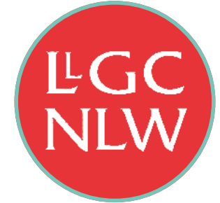
Llyfrgell Genedlaethol Cymru

The organization has been very supportive of the learners who have been/are working on their ILM qualifications in leadership and management. Nant Gwrtheyrn has a pleasant and welcoming atmosphere and the mentoring of the program is exceptional. The learners have taken full advantage of Portal training and professional development.